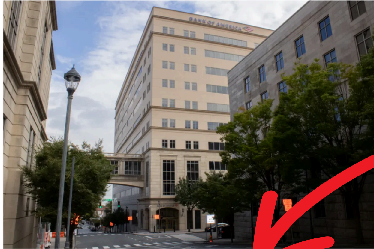
Transformation of Bracebridge II into a hub for universities in downtown Wilmington is dependent on city aid, but some locals are questioning the investment.