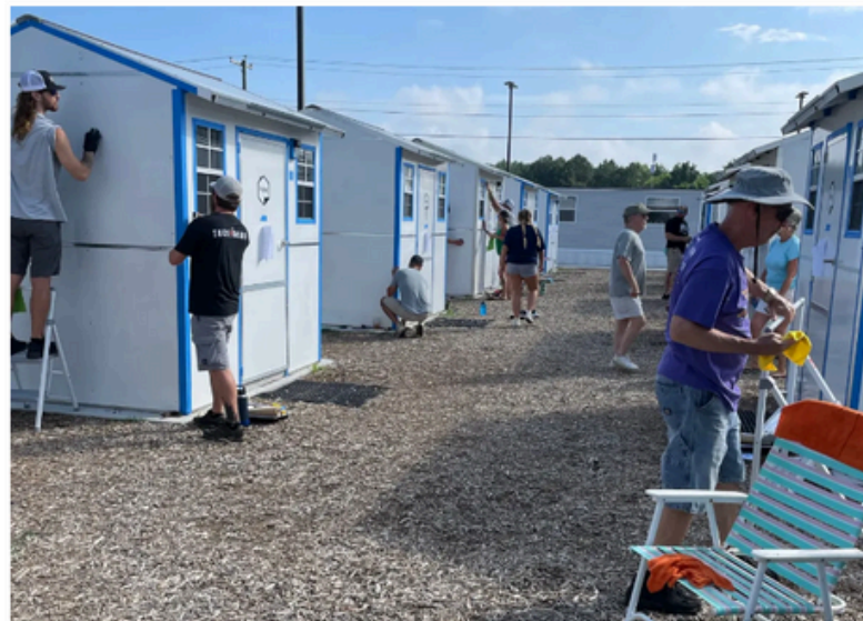
Federal funds helped to set up the Springboard Collaborative pallet village in Georgetown last year, which uses tiny homes in a housing first strategy.

For housing advocate Judson Malone, "the most important thing is that housing – in whatever form you can provide it – is fundamental."